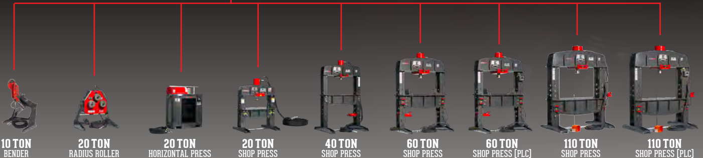
10 TON BENDER

TURN THE PAGE TO VIEW OUR FULL LINE OF ATTACHMENTS & ACCESSORIES FOR THE 120 TON IRONWORKER