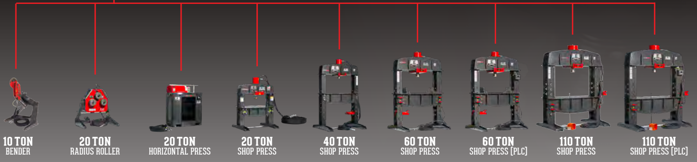
10 TON BENDER 20 TON RADIUS ROLLER 20 TON HORIZONTAL PRESS 20 TON SHOP PRESS 40 TON SHOP PRESS 60 TON SHOP PRESS 60 TON SHOP PRESS [PLC] 110 TON SHOP PRESS 110 TON SHOP PRESS [PLC]

TURN THE PAGE TO VIEW OUR FULL LINE OF ATTACHMENTS & ACCESSORIES FOR THE 75 TON IRONWORKER